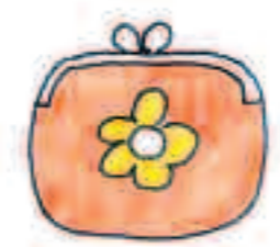
... Mum's purse