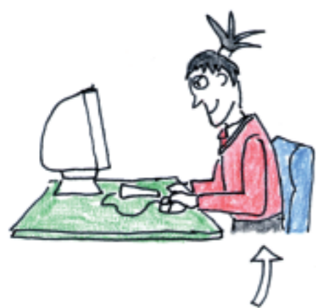
Top researcher at work!

Research means finding out about things and that's something I'm good at!