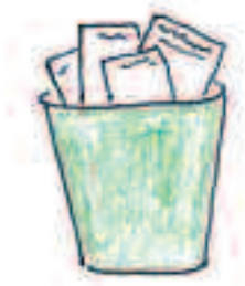
... the bin!