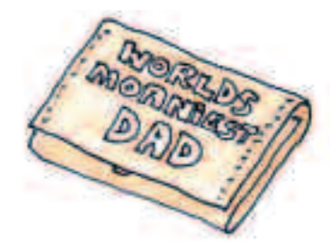
... Dad's wallet